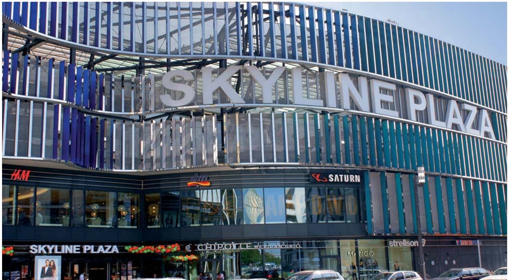
Corrugated suction effect: designed by Jourdan & Müller, the Skyline Plaza's louvered wall creates a distinctive accent.

The Europaviertel is a widely acclaimed urban development scheme in Frankfurt/Main. Work on the complete area is scheduled for completion in 2019, by which time it will house some 10,000 residents and around 30,000 workplaces. The opening of the Skyline Plaza shopping mall in August 2013 gave an enormous boost to the new quarter's profile.