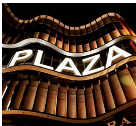
Energy-efficient LEDs illuminate the vertical louvers at night.