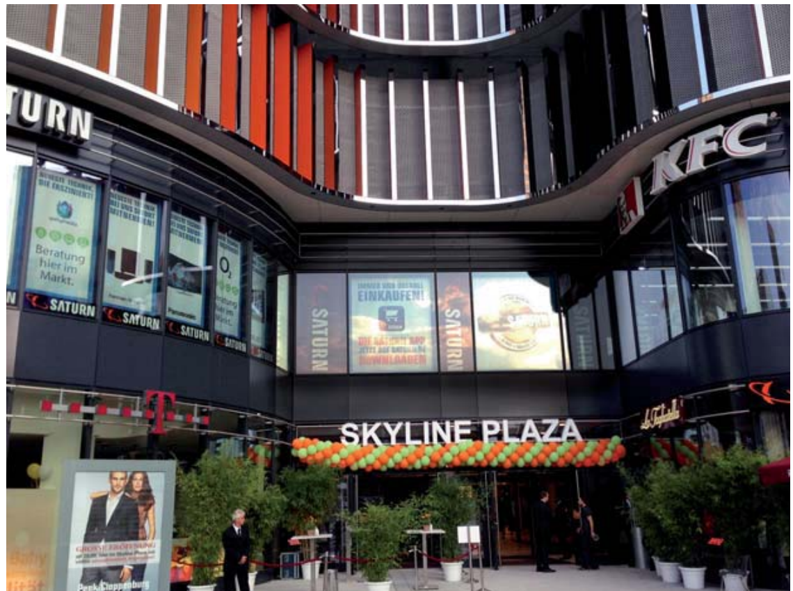
Centrally located on Europallee: the main entrance to the Skyline Plaza.

The tasks facing Anders Metallbau were multifaceted: in the area over the