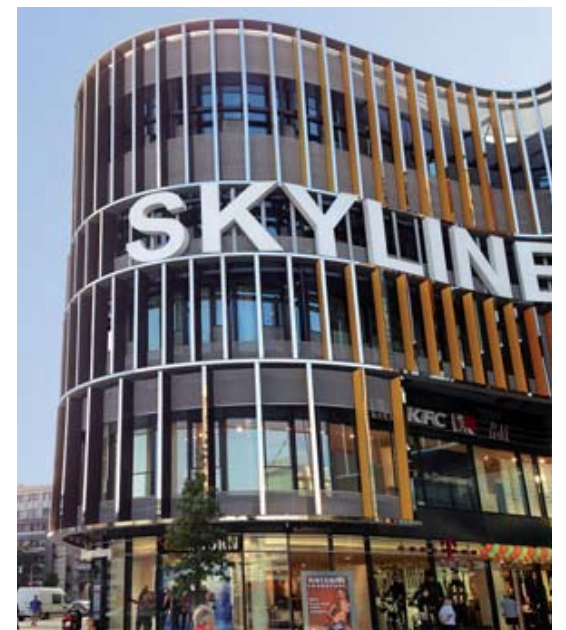
The louvered wall emphasizes the living design.

On plan, the five-storey building forms a large oval. Served by a car park at basement level, the spacious shopping emporium occupies the ground and first floors. This is clearly signalled on