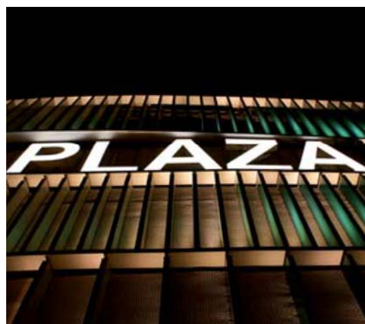
The innovative colour scheme of the louvers, reminiscent of a rainbow from some angles, plays with the onlooker's perception.