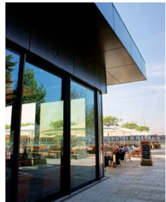
Unique feature: the flat roof, designed as a „fifth facade“, adds the final touch to the overall aesthetic concept.