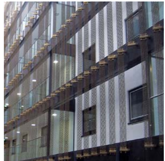
Atrium with expanded-metal screens

architects and project engineers faced the thorny task of finding an appropriate structural solution – if possible, one suitable for all three crane houses, both the two commercial buildings and the residential northern block. Yet it soon became clear, during the initial design meetings that the different occupancies called for radically different structural concepts. Given that Pandion Vista, for instance, had lower storey heights than the office facilities, it was able to fit an extra three levels into the same envelope. The more stringent sound-control regulations